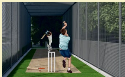
PROVISION FOR CRICKET PRACTICE NET