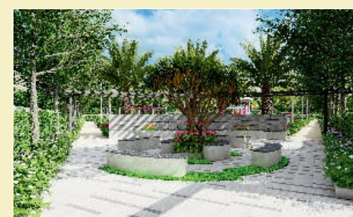
SENIOR SEATING AREA