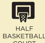
HALF BASKETBALL COURT