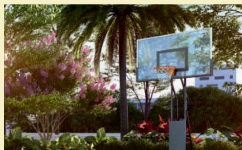
HALF BASKETBALL POST